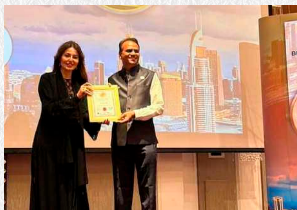
Best Institute offering Innovative Programs to Indira Institute of Management, Pune at 9 th Edition of World Marketing Congress and Awards at Taj Lands End, Mumbai