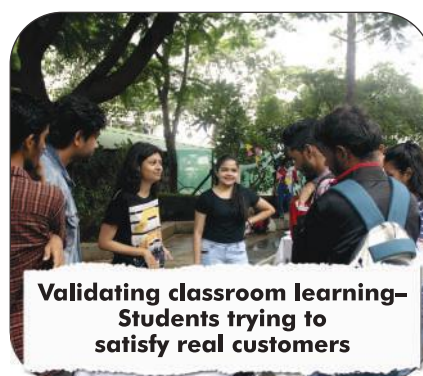
Validating classroom learning- Students trying to satisfy real customers