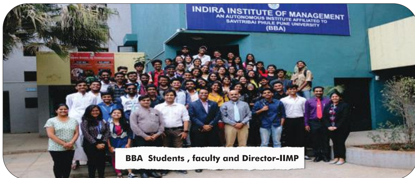
BBA Students , faculty and Director-IIMP