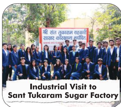
Industrial Visit to Sant Tukaram Sugar Factory