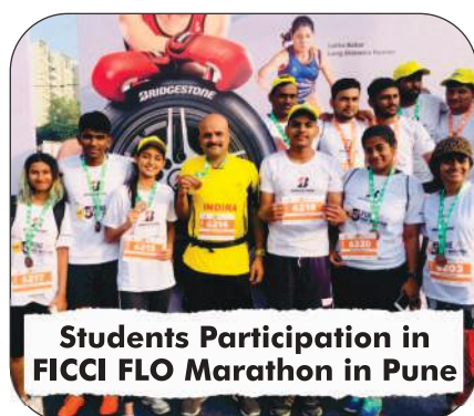
Students Participation in FICCI FLO Marathon in Pune